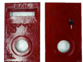
DG1 - RANDWICK