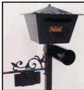
RG1 - SHEFFIELD