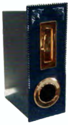
HG2 - VICTORIAN