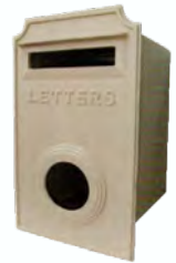
AG2 - ASCOT