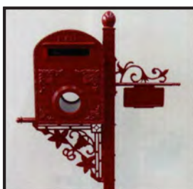
CG1 - WINDSOR