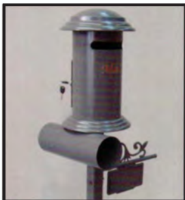
MG1 - APOLLO