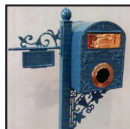
CG2 - WINDSOR PREMIER