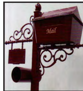
GG1 - COTTAGE