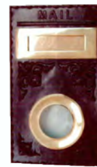
AG3 - EMPRESS PREMIER