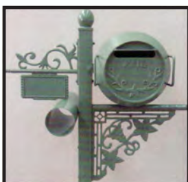
EG1 - COUNTRY