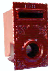
AG1 - EMPRESS